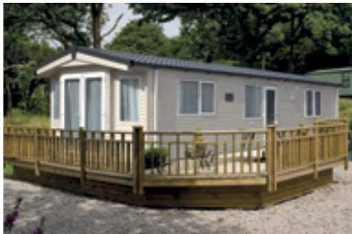
Model illustrated is the 38 x 12 – 2 bedroom with optional front French doors