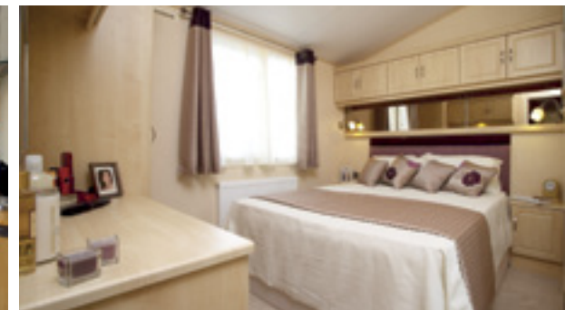
Model illustrated is the 40 x 12 – 2 bedroom with optional front French doors